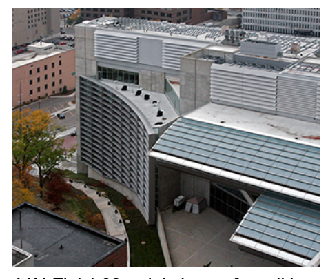
VAI Finish03_ariel view:cafe wall.jpg