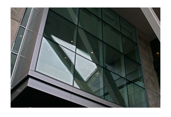
VAI Finish90_exterior:Angel wall detail...