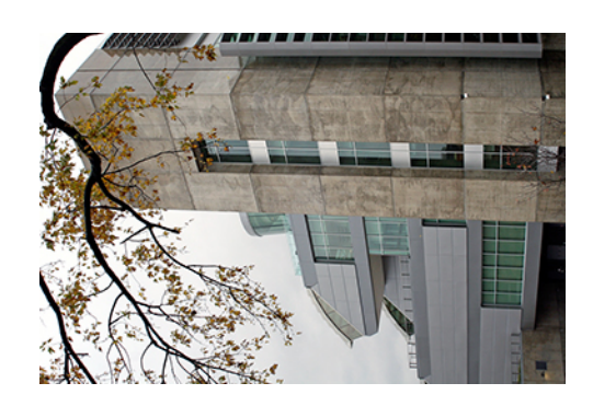
VAI Finish01_south elevation.jpg