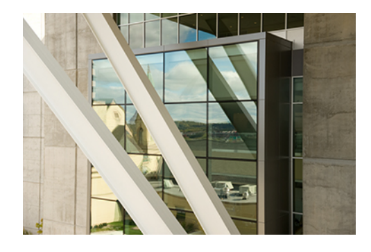
Jeff Dykehouse, Dykehouse Photogra...