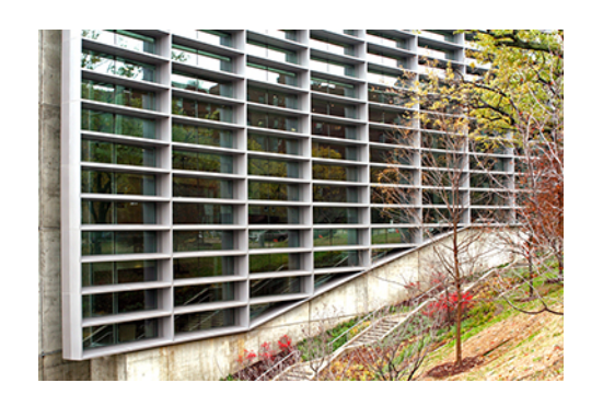
VAI Finish96_exterior:cafe wall.jpg