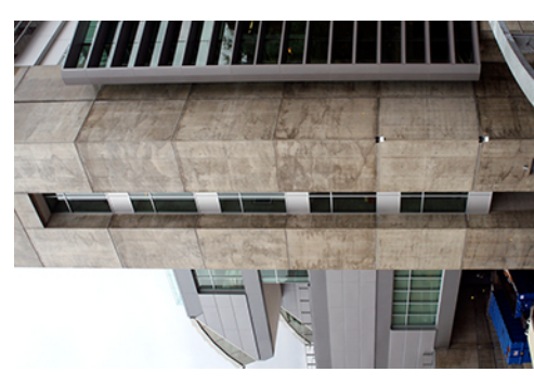
VAI Finish99_exterior:south elevation.j...