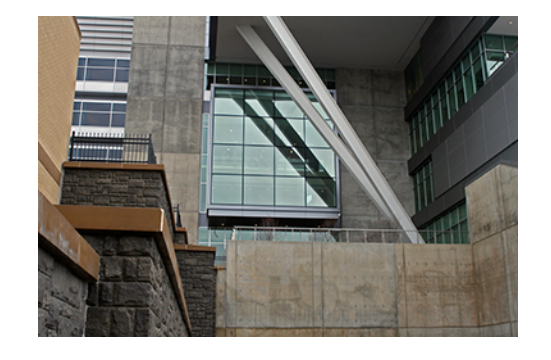
VAI Finish81_exterior:Angel wall.jpg