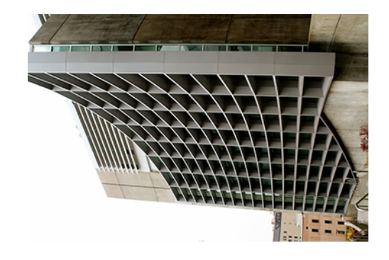
VAI Finish93_exterior cafe wall.jpg