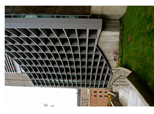
VAI Finish92_exterior:cafe wall.jpg