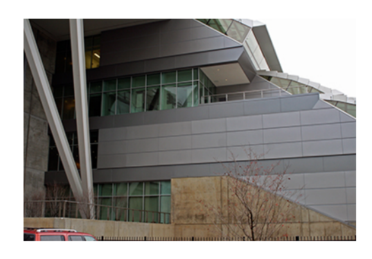
VAI Finish88_exterior:north elevation.j...