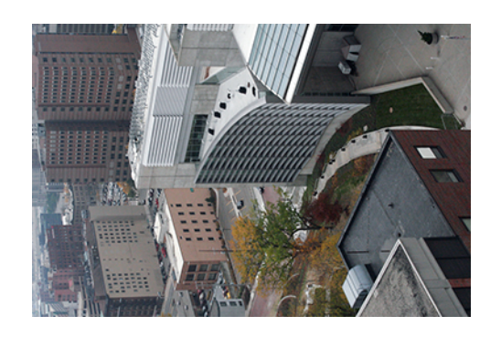
VAI Finish04_ariel view:cafe wall.jpg