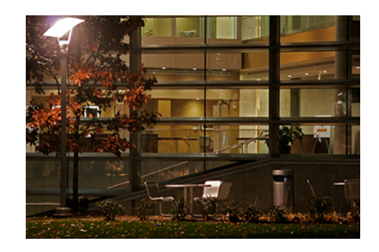
VAI Finish07_night view:cafe wall.jpg