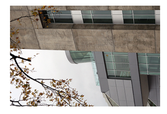
VAI Finish03_south elevation tight cro...